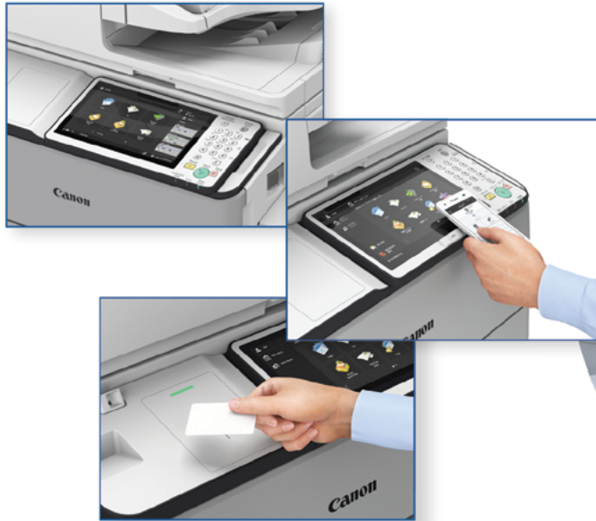
Optional accessories shown above.