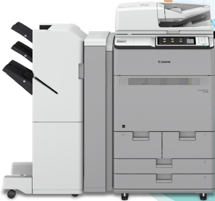
imagePRESS Lite C170 shown with optional accessories.