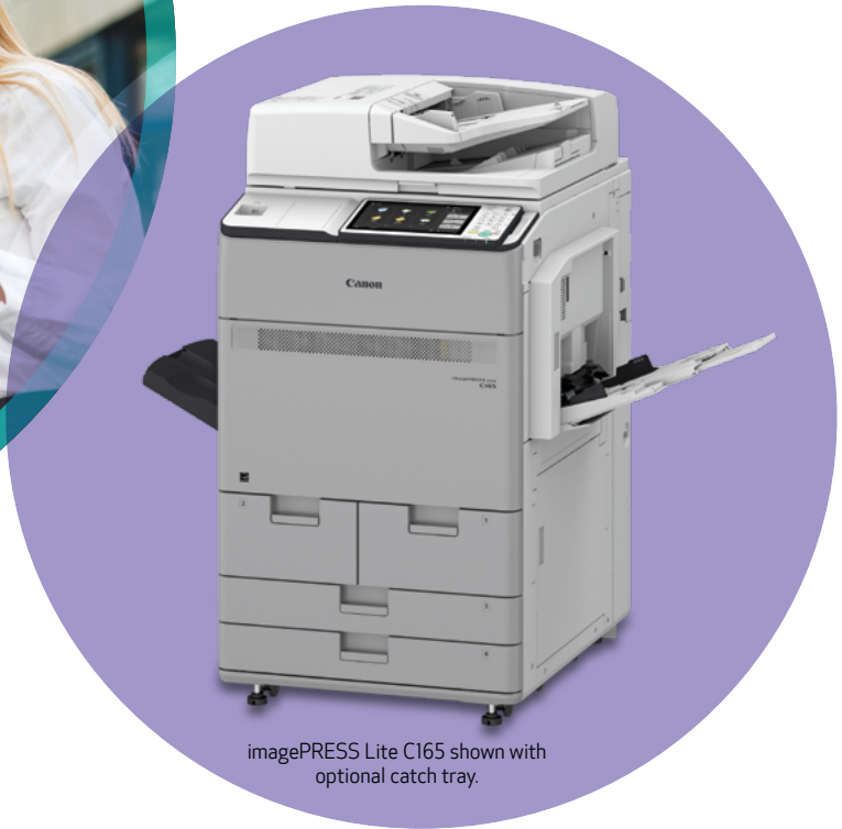
imagePRESS Lite C165 shown with optional catch tray.