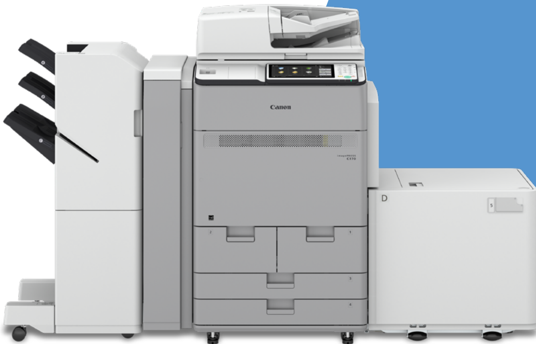
imagePRESS Lite C170 shown with optional accessories.

The imagePRESS Lite C170 Series multifunction printers bring together Canon's deep understanding of the enterprise and production marketplaces. Now, the features necessary for both high-end office and light production environments can be utilized in a single, cost-effective, and feature-rich device. With Canon's imagePRESS Lite C170/C165 colour multifunction printers, you'll have the resources to help advance your business—now and in the future.