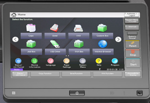
TASKalfa 9003i / 8003i / 7003i