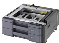
PF-730 (B) 2 x 500 Sheet Tray (Ledger)

Hole Punch Option PH-7A for DF-7110 / DF-7130