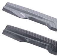
Copy Tray (D)