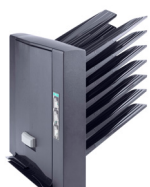
MT-730 (B) 7 Bin Mailbox