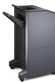
DF-7130 4,000 Sheet Finisher 100 Staple / 100 Manual Staple