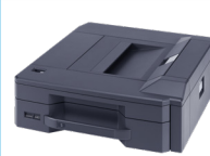
PF-7130 500 Sheet MPT