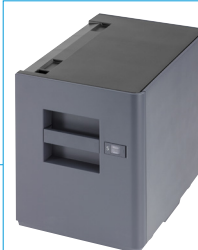
PF-7120 3,000 Sheet Side Deck (Letter)