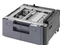
PF-740 (B) 2 x 1,500 Sheet Tray (Letter)