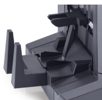
BF-730 Booklet / Tri-fold Unit