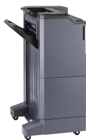
DF-7110 4,000 Sheet Finisher 65 Staple / 65 Manual Staple